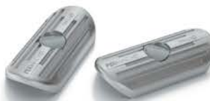
TechNode For Pool Ladders Sold in Pairs