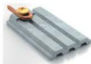
TechNode For Pool Lights

Why use TechNodes: TechNodes are the result of research done by Scientists at the Georgia Institute of Technology. TechNodes are sacrificial anodes designed specifically to protect critical metal components in Salt System Swimming Pools. TechNode In-line is designed to protect any metal components in the pools plumbing, including pool heaters and heat exchangers. TechNode Ladder will protect pool ladders that are submerged in the swimming pool. TechNode Light will prevent corrosion of metal components on underwater lights. TechNode Utility is designed to protect any other metal components in the swimming pool. TechNodes are cast from Mil Spec Zinc, have high surface area to volume characteristics resulting in the most efficient Pool Anodes on the market.