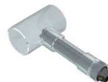
TechNode In-Line for Heaters/Plumbing