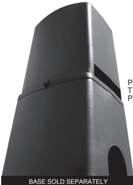
Power Tower PT-6000