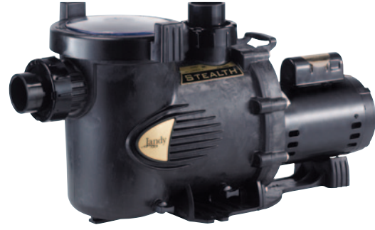
Jandy Stealth™ Pump by Zodiac