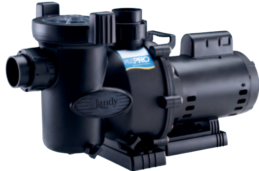
Jandy FloPro™ Pump by Zodiac