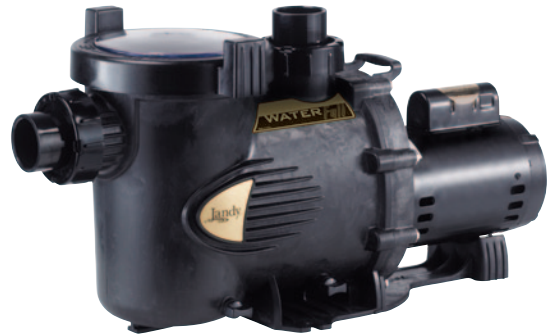
Jandy WaterFall Pump by Zodiac