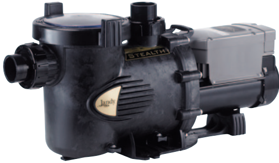
Jandy® ePump™ by Zodiac®