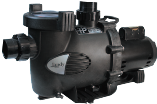
Jandy® PlusHP Pump by Zodiac®